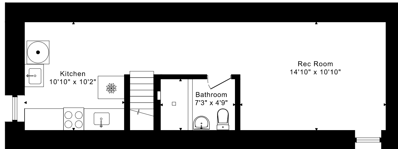
LOWER FLOOR 615 SQUARE FEET